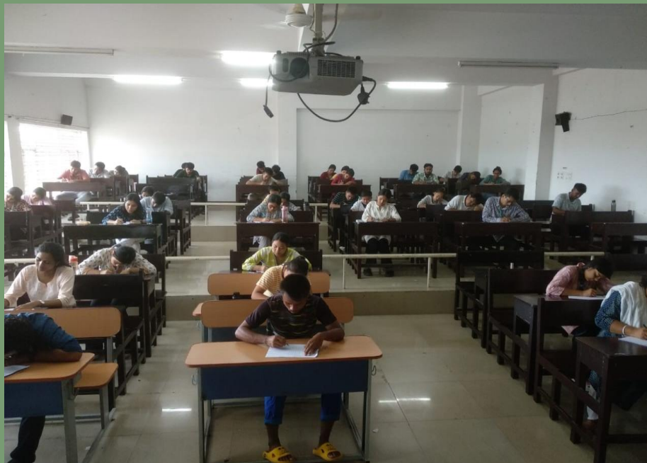
A glimpse of the Extempore Essay Writing Competition

More than 100 students participated in the competition. The best four essay writers from each language were awarded cash prizes.