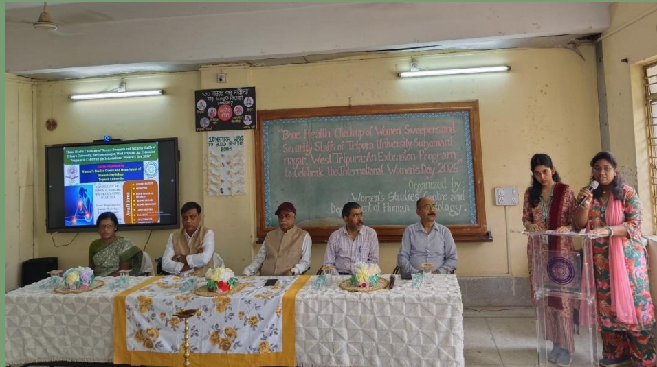
Respected dignitaries on the dias during the Inaugural session

prescriptions. Participants' dietary habits and lifestyles were recorded to identify risk factors related to osteopenia and osteoporosis. The camp significantly benefited the participants through free health screening, medical consultation, and diagnostic reports, while also encouraging them to adopt affordable, nutrient-rich diets and healthier lifestyles for better bone health.