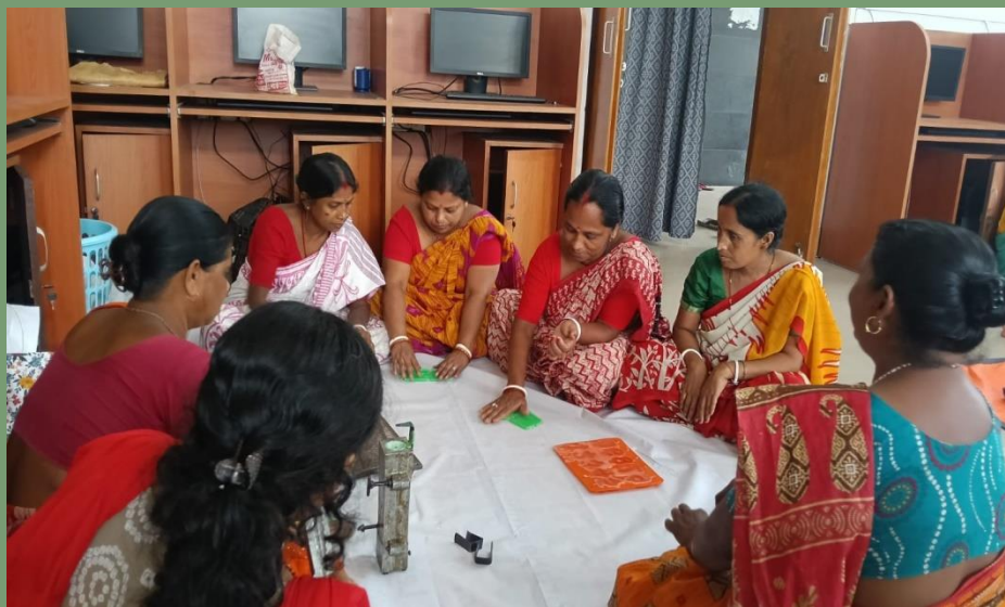
Trainees are making candles during the Training Programme

significant step towards enhancing the socio-economic status of women and promoting community development.