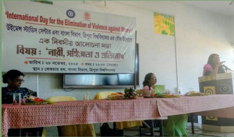
Distinguished speakers addressing the participants during the lecture series

for meaningful dialogue and reflection, encouraging participants to critically engage with issues related to gender-based violence and to promote a more inclusive and equitable society.