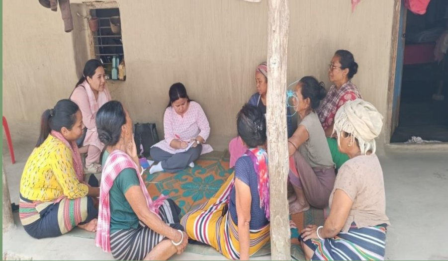
Our research team during the FGD with the Tribal Women

education and a low-to-mid income, reflecting a community that has benefited from some government outreach but remains constrained by economic vulnerability, cultural norms, and gaps in health behaviour that infrastructure provision alone has not been able to bridge.