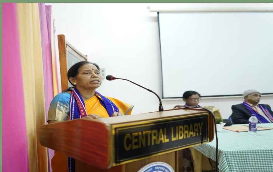
Hon'ble Director of CWDS, addressing the gathering in the Capacity Building Workshop on GST Reforms

for interdisciplinary dialogue, evidence-based policy, digital literacy, cooperative federalism, and gender-sensitive fiscal research for inclusive growth.