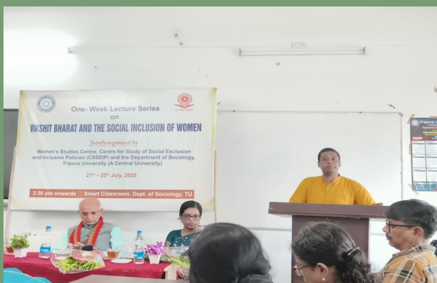
Distinguished invitees and speakers in the one week lecture series