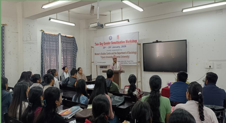
Hon'ble Vice-Chancellor, TU addressing the participants during the Workshop

and society. The workshop witnessed active participation from students, encouraging meaningful discussions and interactive sessions. Overall, the programme was highly informative and contributed significantly to promoting gender awareness and sensitivity among the students.