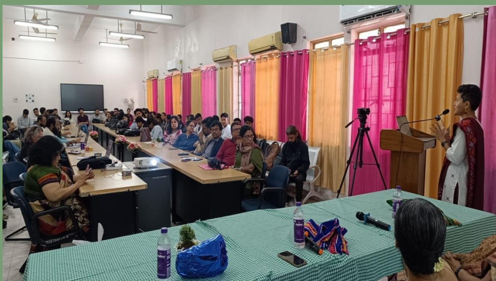
Invited Speakers and Participants in the National Seminar

invisibility of unpaid care work and its exclusion from economic valuation. Prof. N. Manimekalai presented micro-level evidence of gender disparities in labour and development. The seminar concluded by emphasizing that development must prioritize equity, dignity, and inclusion, advocating for gender-sensitive and structurally transformative policy approaches beyond mere economic growth.