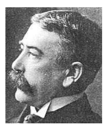
Fig. 4.2 Ferdinand de Saussure, the Founder of Structural Linguistics

What was important in Saussure's view was a system of signs, a structure, and the meaning of each sign, which is produced by the relationship among signs within the system. Here comes the importance of relations of difference, including binary oppositions, as the meaning of the word 'dark' comes not from some intrinsic properties of the world, but from the word's binary opposition to the word 'light'. When this view is applied to the social world, the meanings, the mind and ultimately the social world itself are shaped by the structure of language. Thus, structural linguistics does not focus on the existential world of people shaping their surroundings; instead, all aspects of the social world are shaped by the structure of language. The Saussurean notion of sign systems were further taken to the field of semiotic, encompassing not only language but also other sign and symbol systems like body language, literary texts and all sorts of communication. It is evident that Saussure, who became the inspirational source for post-modernism, did not reject the societal aspect and stressed that the role of the signifier, as word, is to impart meaning to the signified, a thing or living being, etc.