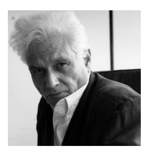
Fig. 4.3 French Philosopher Jacques Derrida

Paul de Man was a member of the Yale School and a prominent practitioner of deconstruction as he understood it. His definition of deconstruction is that, It is possible, within text, to frame a question or undo assertions made in the text, by means of elements which are in the text, which frequently would be precisely structures that play off the rhetorical against grammatical elements.'