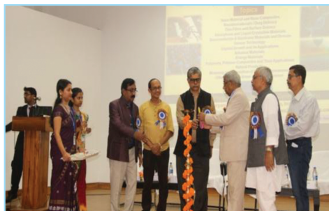
2nd International Conference on Material Science (ICMS- 2017) held on 16th - 18th February, 2017