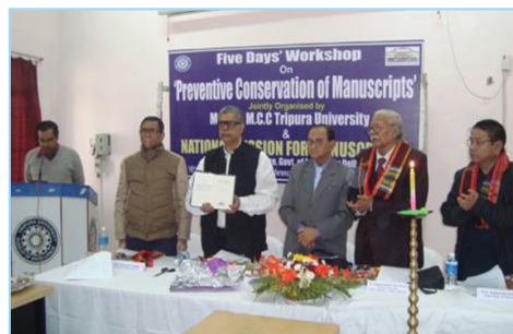
Five days workshop on Preventive Conservation of Manuscripts jointly organized by MRC&MCC and NMM Ministry of Culture Govt. of India .