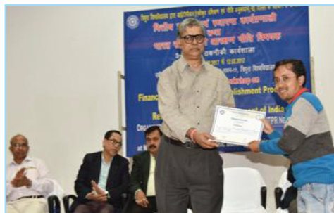
3 day Technical Workshop on Financial Management & Establishment Procedure organized by the ITPR New Delhi, in association with Tripura University.