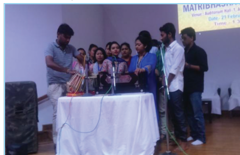
Matrihasha Diwas 2017 at TU Group Song in Hindi performed by the Students of Department of Music.