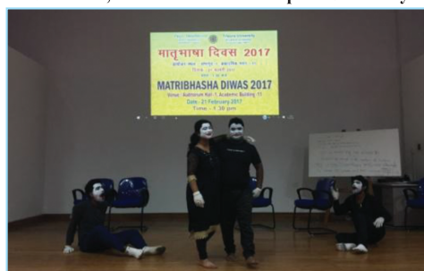
Matrihasha Diwas 2017 at TU Mime Act performed by the Students of Department of Fine Arts.