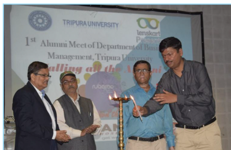
1st Alumni Meet of the Department of Business Management, 2017