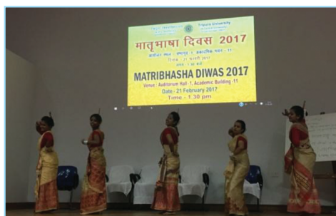
Matrihasha Diwas 2017 at TU Bihu Dance performed by the Students of Department of Microbiology