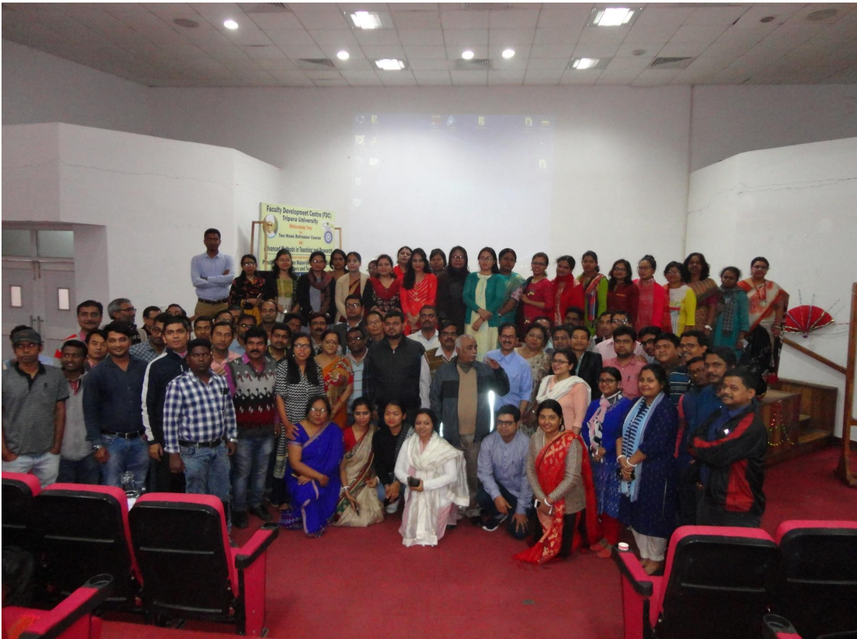
Group Photo of the participants with FDC members.