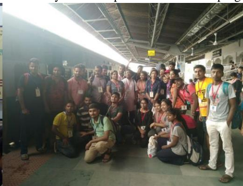
CUSB team reached at Agartala