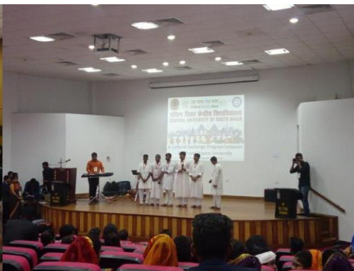
Cultural Programme at TU by the CUSB Team

A seminar was organised on “Digital India” for the NSS Volunteers. The hon'ble Vice-Chancellor, Tripura University delivered a lecture about this issue, on 13 th August, 2018 in the NSS class room. This was an interactive session and he mentioned the nitty-gritty of Digital India. This was an collaborative initiative with Computer Centre, Tripura University.