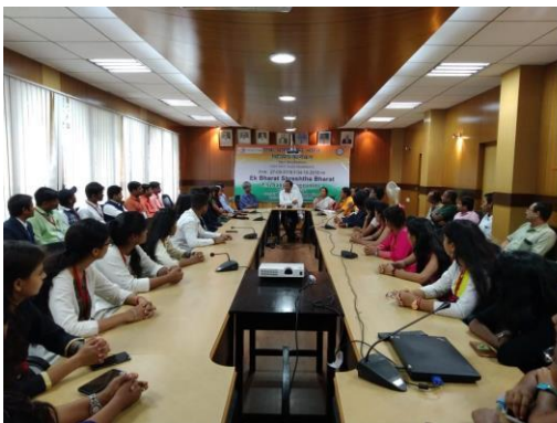
CUSB Team at TU