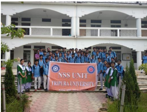
Social Media Programme