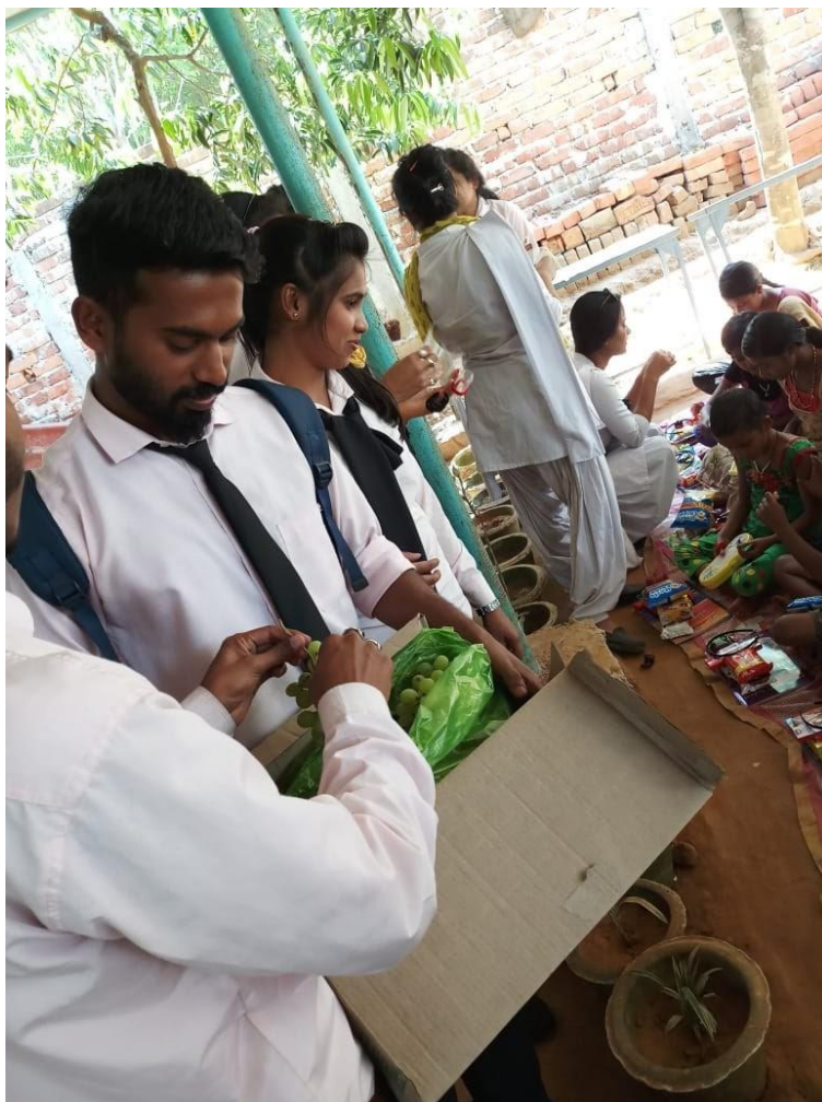
Orphanage visit and Donation- 2018 at Nabaprantik Orphanage, Agartala. 60 Students were a part of it.