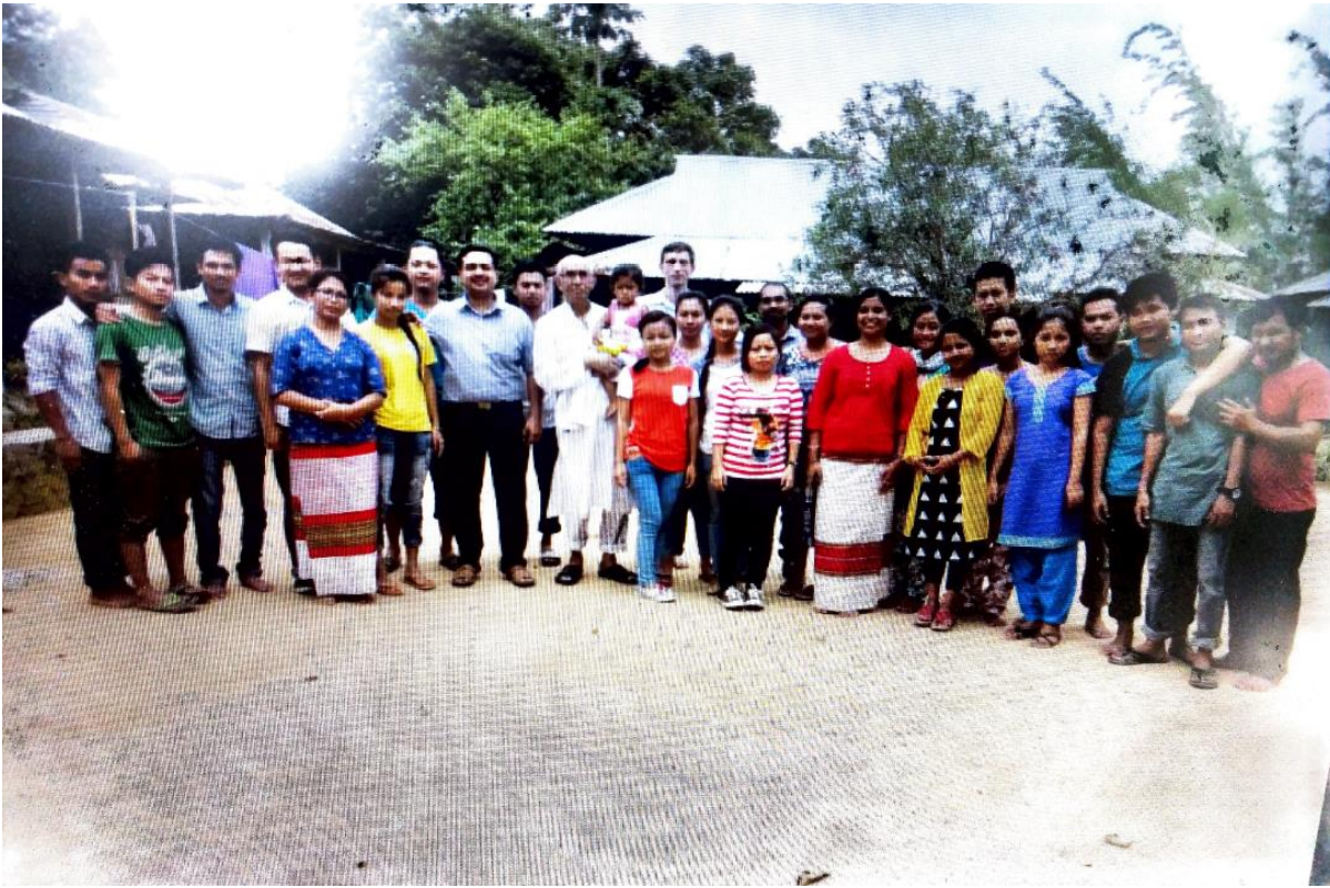
Excursion activity in South Tripura: Commit Sociology and Nature Experience, Department of Sociology during the Acad year 2017-2018. 43 Students were a part of it.