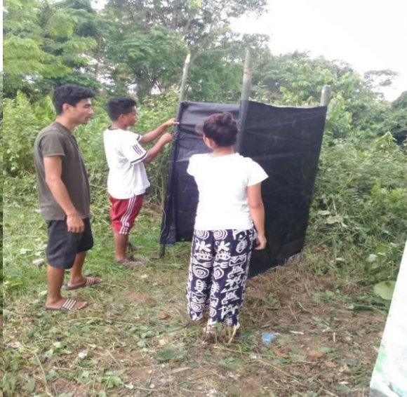
Volunteers helped villagers to make Toilet and to renovate it.