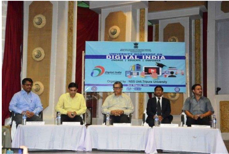
Inaugural Ceremony of Digital India Programme