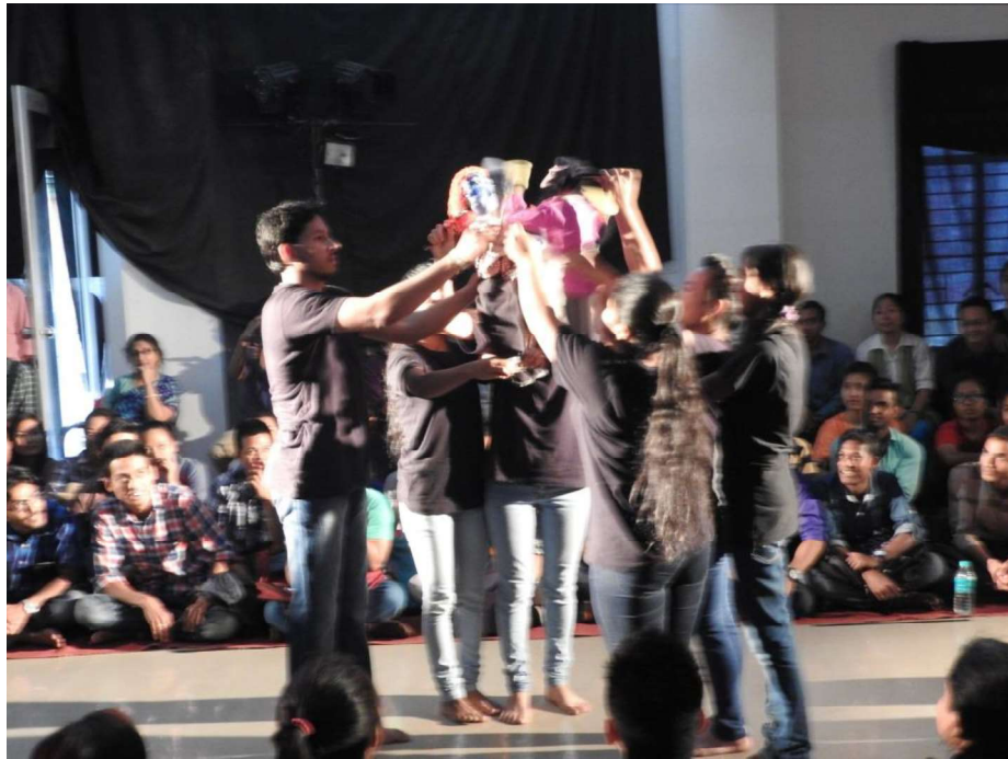
Participatory theatre by National School of Drama on the topic of Gender Equity. The workshop was organized on the theme of "Gender Equity" in the year 2015. This workshop was attended by 200 students.