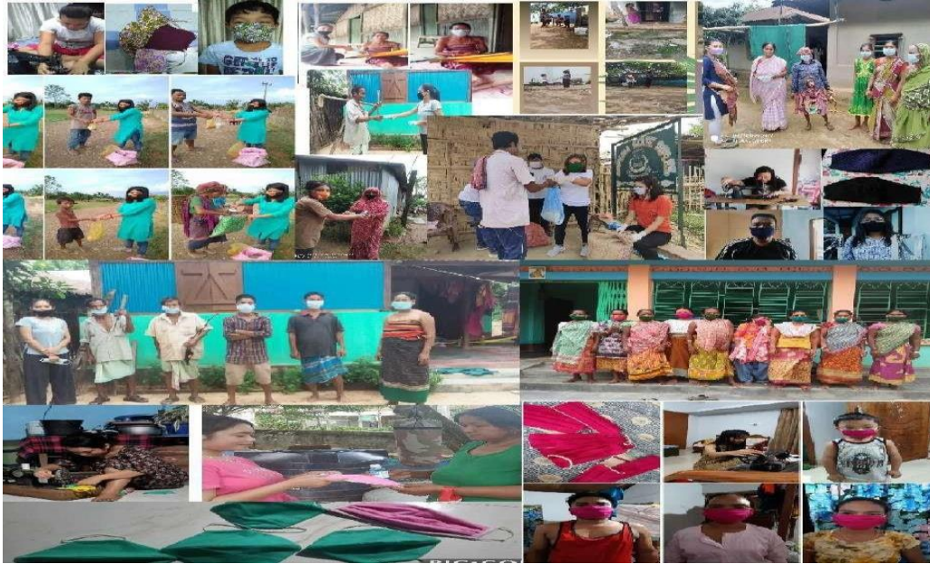
Free masks were distributed by the NSS volunteers among the localities of the Agartala Cities and Village areas