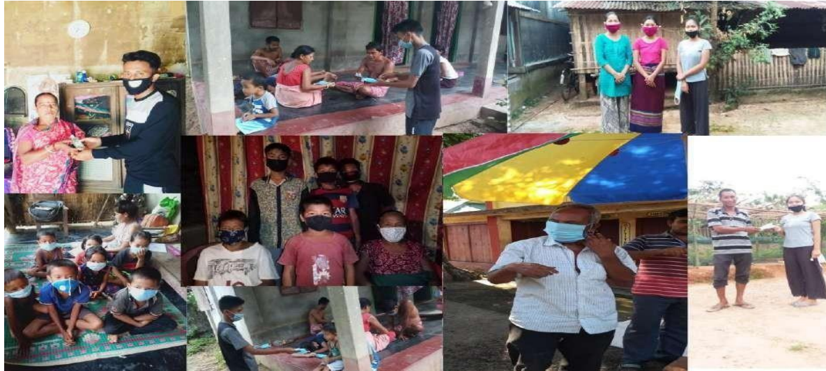
The NSS volunteers distributed sanitizers among the villagers of the adopted villages by Tripura University