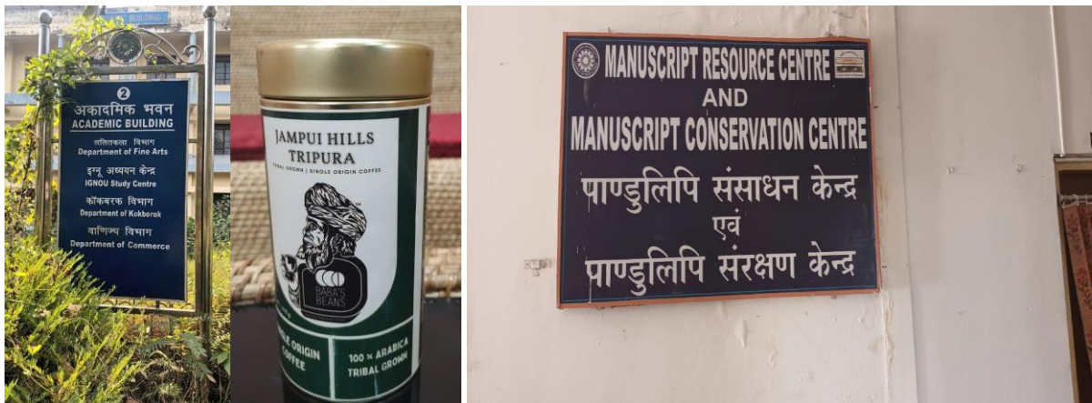
Kokborok Department Local product in National Market Manuscript Resource & Conservation Centre at TU