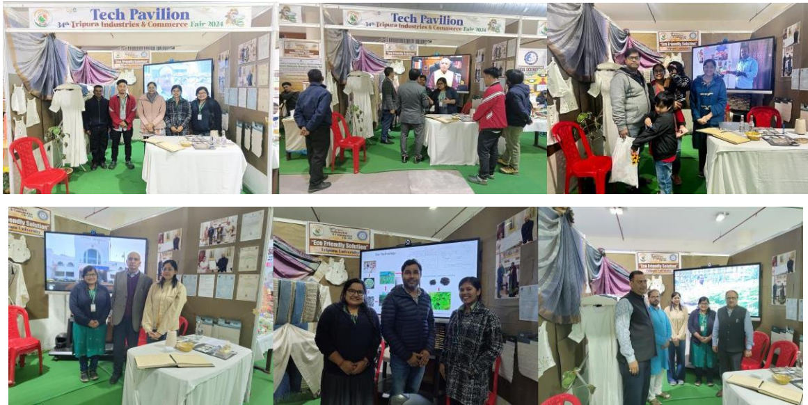
TU fraternity in the Technology Demonstration Stall at 34 th Tripura Industry and Commerce Fare