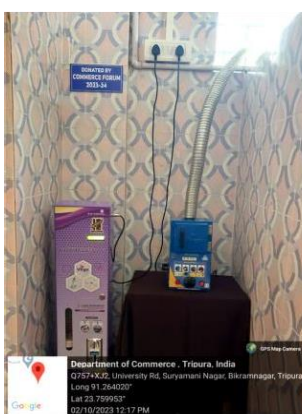
Vending machine and incinerator