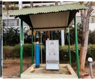
Outdoor Drinking Water