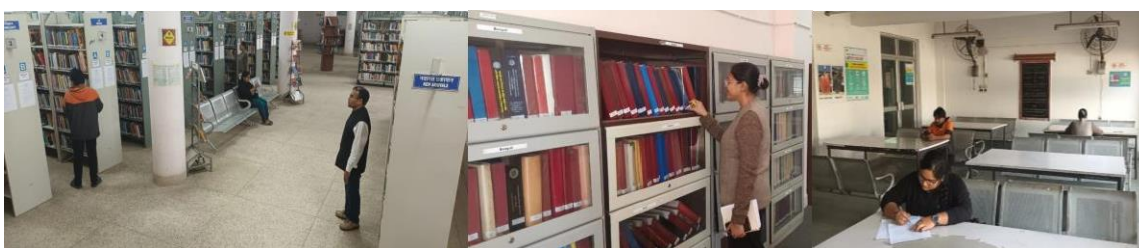
Library and Wi-Fi facility