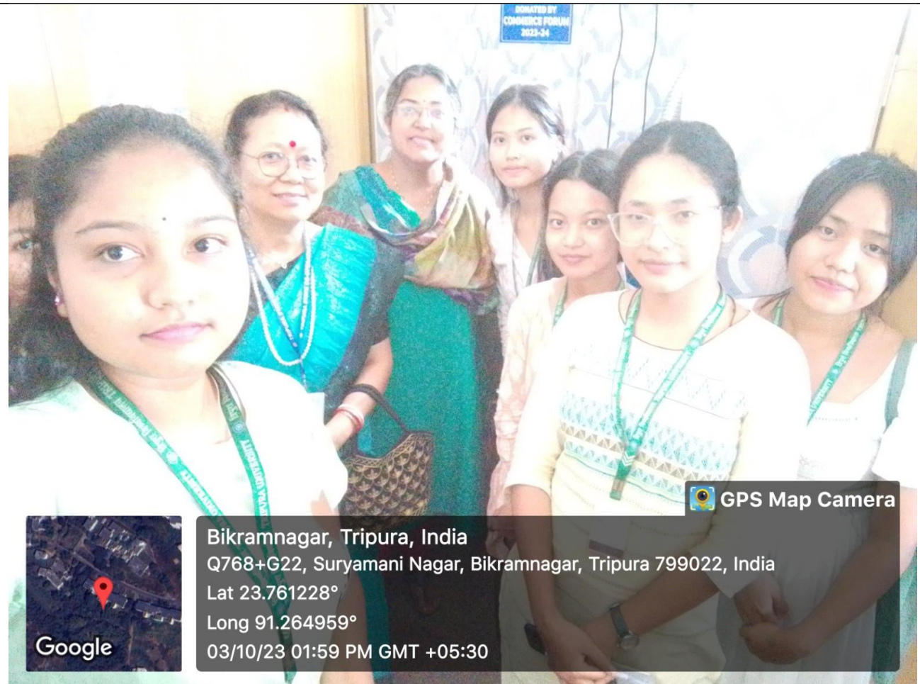
Photo Cursey: Students of the Department of Commerce, 2023-24 Batch