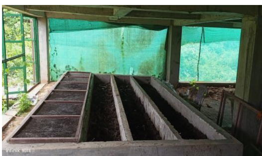
Vermicompost Unit at TU

At Tripura University we are inclined to create an eco-friendly environment for holistic development of the students. We use the open land of 79 acres within the premises for organic cultivation of fruit and vegetables using the vermicompost developed in-house from the biodegradable wastes. The produce is shared with the hostels and sold at subsidised rates to the University fraternity, ensuring appropriate waste management with healthy food. The extended hours of library with Wi-Fi enabled campus ensures round the clock access to reading material for the students and scholars; the installation of sanitary napkin vending machine and incinerator in the ladies washroom, the functional health centre and the counselling centre ensures attending to the health, medical and emotional needs of the students; elaborate outdoor sports facility, open gym and drinking water facility ensures recreational opportunities post office hours within the secure campus of the University.