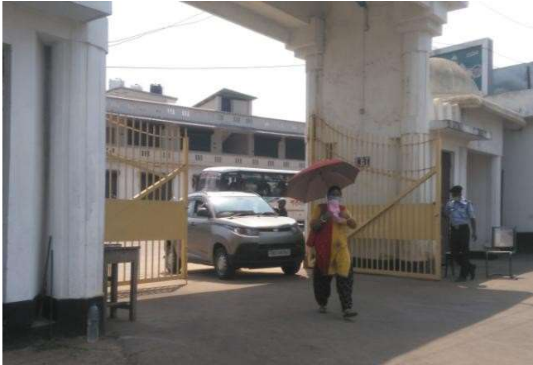
Car entry in the campus after permission from security