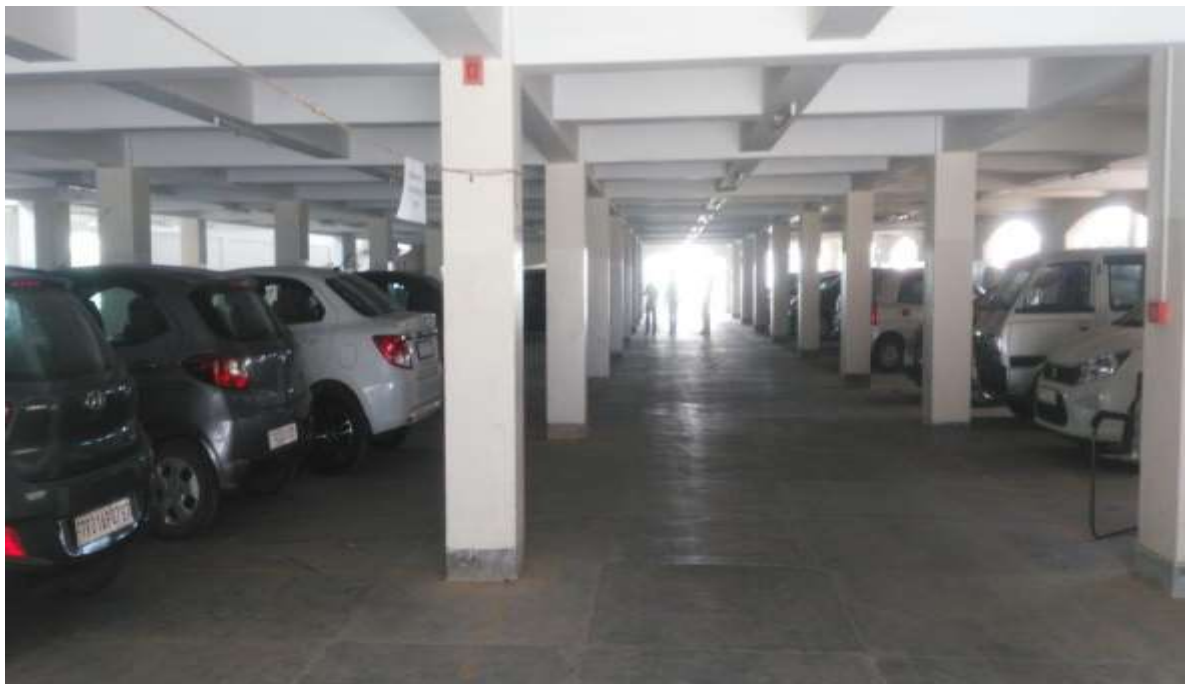
Car parking zone in the campus