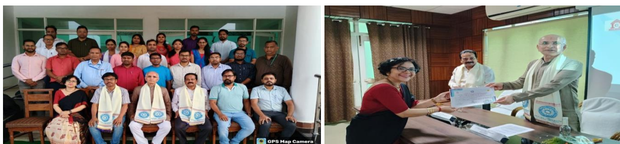
Group photo and certificate Distribution