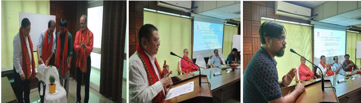
Inauguration of the Program