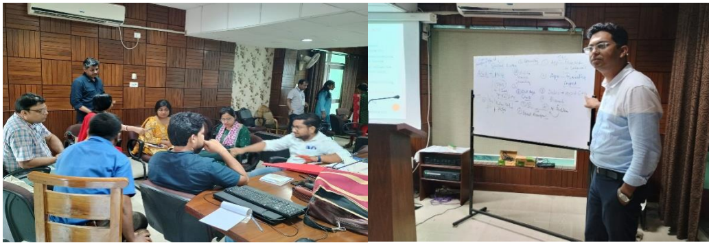
Session by the experts