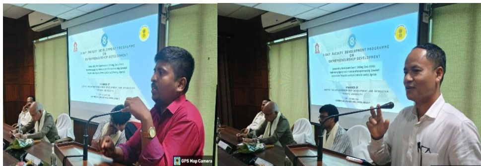
Session by the experts