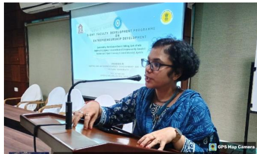
Hosting of the session