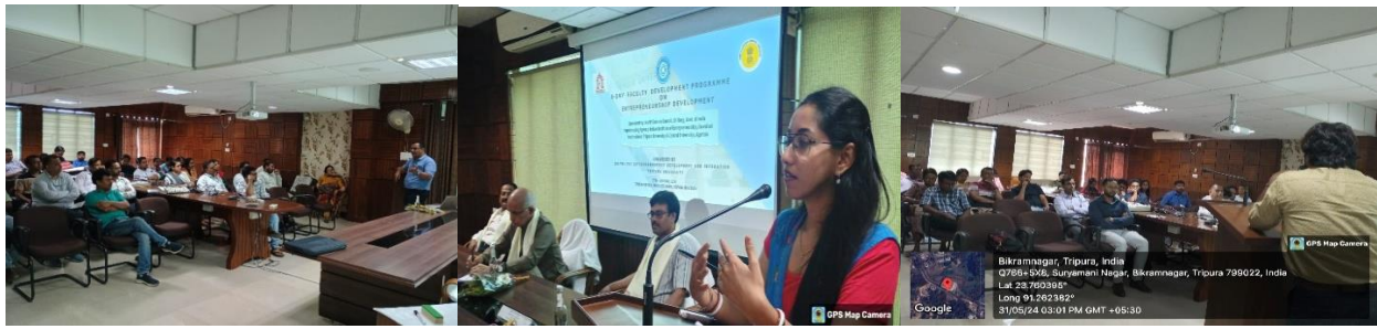
Session by Experts and Know your participant session