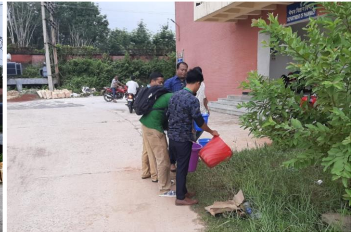
Plastics are removed by the students in a program