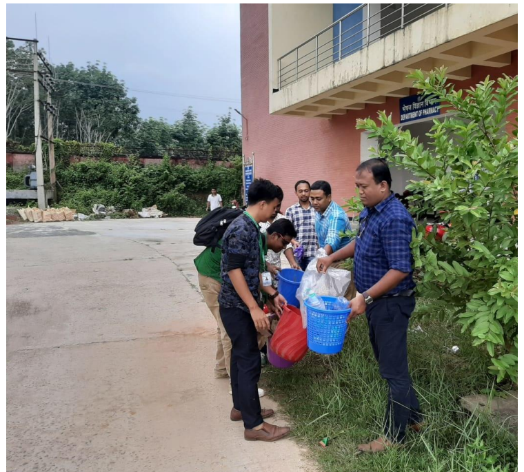
Plastics are removed by the students in a program