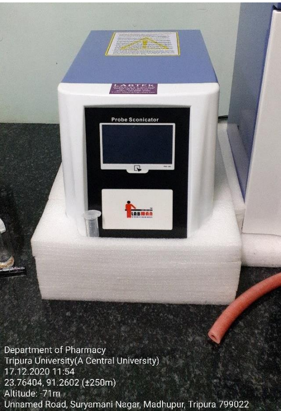
Department of Pharmacy Tripura University(A Central University) 17.12.2020 11:54 23.76404, 91.2602 (±250m) Altitude: -71m Unnamed Road, Suryamani Nagar, Madhupur, Tripura 799022