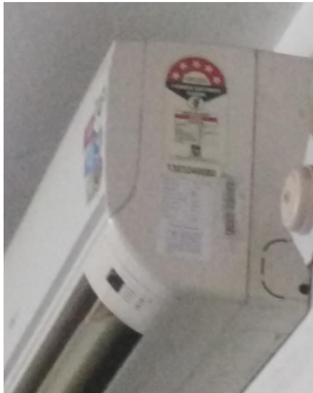
5 star equipment to save energy