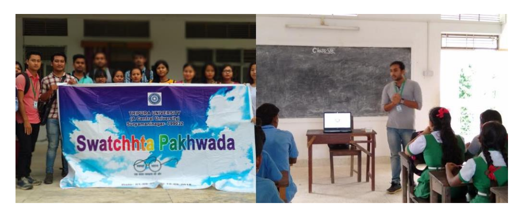
Social Media Programme