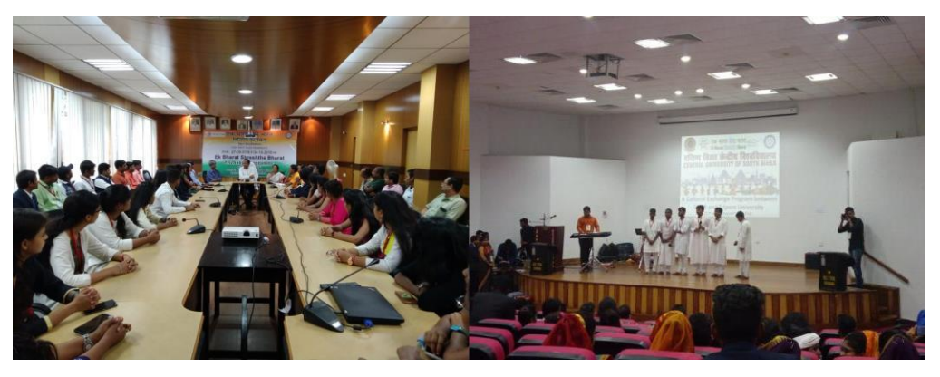
CUSB Team at TU