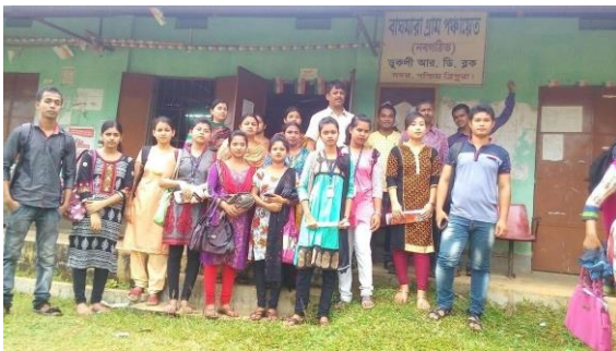
Swacha Bharat Avivan: