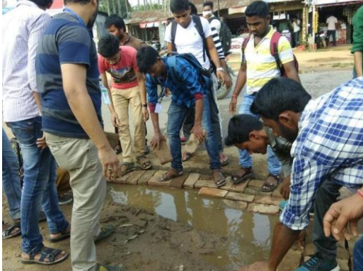
Working with the Panchâyat: