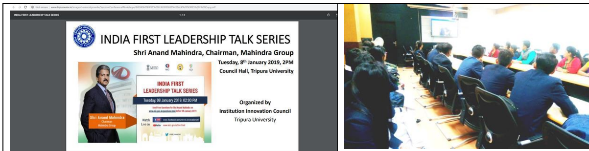
Students, Teachers and Staff taking part in the INDIA FIRST LEADERSHIP TALK SERIES organized by IIC, Tripura University on 8th January 2019. Speaker: Shri Anand Mahindra, Chairman, Mahindra Group