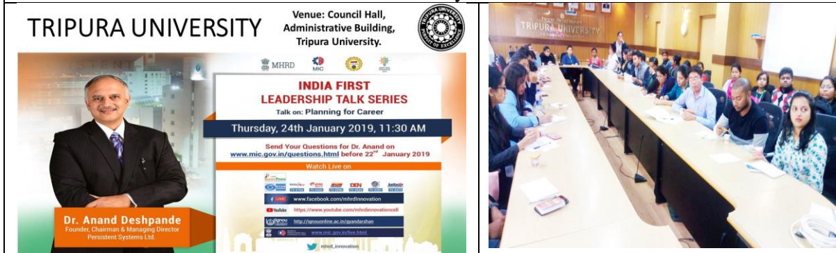
INDIA FIRST LEADERSHIP TALK SERIES. Episode 2: Livecasting on 24th January 2019