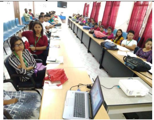
Moments of INDIA FIRST LEADERSHIP TALK SERIES held on 22nd August 2019. Speaker: Hon'ble Union Minister of HRD, Dr. Ramesh Pokhriyal Nishank. Govt. of India