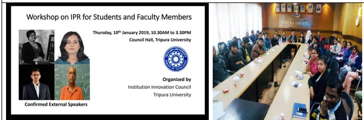
Students, Teachers and Staff taking part in "Workshop on IPR for Students and Faculty Members". Held in Tripura University Campus on 10th January 2019 by IIC, Tripura University.